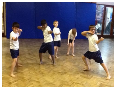
The Meerkats have been working very hard in their PE lessons this week, choreographing their own dances around the theme of sport