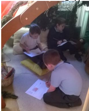
F2 have been working hard in the classroom adding up 2 numbers. They have played in the ice outside and written their own snow bear stories.