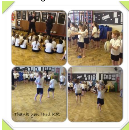
This week the Meerkats have had the pleasure of Hull KR coming in to coach them on some rugby skills. They showed great teamwork and relationships in each activity.