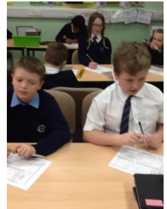
Year 6 Leopards behaviour for learning topic.