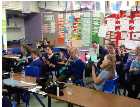
The Tigers have enjoyed playing the Ukulele and learning the different chords.

This week for their topic the Panthers have been studying a local hero... William Wilberforce. They have worked hard to include special Allan Pear sentences and clauses in their diary writing and learnt how to read a four figure grid reference, covering our local area. They have also displayed enthusiasm and resilience during a week of assessments.