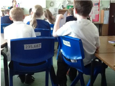
The children in Tigers this week have had fun working out the number seat they have been sat on and which number seat can help them with their work.