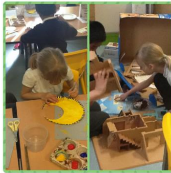
Sharks have been finding out how to build pyramids and also about Egyptian jewellery.