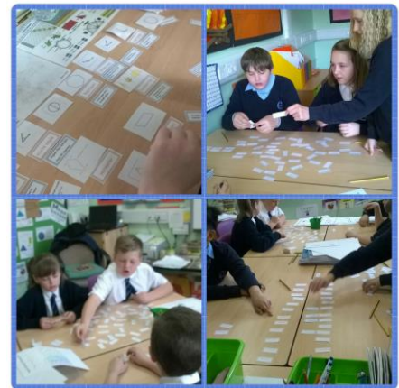
Leaping leopards, we have worked hard this week and made amazing strides forwards to better our understanding of space, shape and measure!