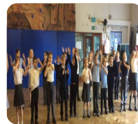
Sharks - @EstcourtSharks

A super week in Tigers has resulted in high achievements from everyone. We have combated our long multiplication, curing some puzzled heads. In Design Technology we have been designing and evaluating the different materials for our tents and are looking forward to constructing them next week.