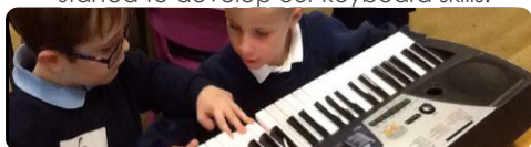
Butterflies - @EstcourtYear2

A fabulous week has been had by all in Year 2. The Butterflies and Ladybirds have thoroughly enjoyed looking at Antarctica in Topic and the wide range of subjects we have covered. As writers we enjoyed pretending to be penguins and telling our loved ones all about our amazing adventure. We also became geographers and looked at the similarities and differences between Hull and Antarctica- there were so many to talk about! Then to top it off, we were musicians and had to be extra resilient when we started to develop our keyboard skills.