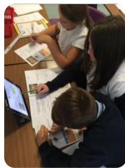
Meerkats - @EstcourtYear4n5

Survival in the desert has been the focus in Writing and Topic this week. We have researched lots of desert animals and even designed a tent in order to stay alive on the sandy plains of the Sahara. In Maths we focused on inverse operations and all of us are making progress due to our determination and resilience!