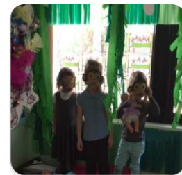
F1 - @EstcourtFS1

A fabulous week has been had by all in Year 2. The Butterflies and Ladybirds have thoroughly enjoyed looking at Antarctica in Topic and the wide range of subjects we have covered. As writers we enjoyed pretending to be penguins and telling our loved ones all about our amazing adventure. We also became geographers and looked at the similarities and differences between Hull and Antarctica- there were so many to talk about! Then to top it off, we were musicians and had to be extra resilient when we started to develop our keyboard skills.