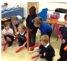
Lions - @EstcourtYear1

Pupils in Lions and Penguins have been extremely busy. We loved discovering the story 'Lost and Found' by Oliver Jeffers and have been using verbs to describe what people and even animals can do. We've shown great resilience in NAPA and have completed our first dance sequence. We can't wait to start a new sequence next week and show them off!