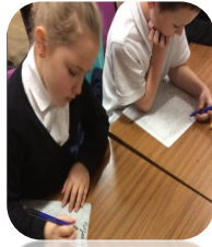
Panthers - @EstcourtYear4

In Maths we developed our work on perimeter and area by drawing our own shapes. Then in Writing, poems were our focus! We looked at the trenches and how we could use rhyming couplets to create emotion. We also really enjoyed our trip to the community centre to see 'Grandma remember me?'