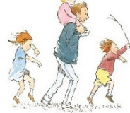
Lions - @EstcourtYear1 Penguins - @EstcourtYr1

A superb week has been had by all in the Butterflies and Ladybirds this week. They have thoroughly enjoyed continuing to learn all about the Great Fire of London in Topic.