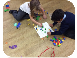
F2 - @EstcourtFS2

We have really enjoyed making repeating patterns in Maths and Writing all about people who help us during English and Big Writing sessions.