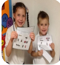
Ladybirds @EstcourtYear 2 Butterflies - @EstcourtYear2