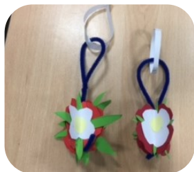
Eagles - @EstcourtYear6

After that, we danced the afternoon away at the Christmas parties followed by a lovely afternoon at church. The readers were an absolute credit to the school- well done Eagles!