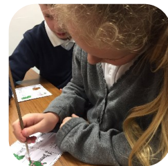
Meerkats

Then on Thursday we had a fabulous time in church and it was the best service we've ever had! Great singing done by all! Thank you to all our families for coming.