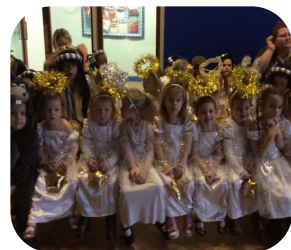
F2 - @EstcourtFS2

Thank you to all our grown ups for all the support this year from donations of cooking ingredients, supporting Phonics Friday and Stay and Play ,to costumes for the Nativity- Happy Holidays!