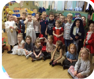
F1 - @EstcourtFS1