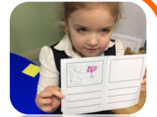
F2 - @EstcourtFS2

In FS2 we have been authors this week and also scientists as we observed the features of various animals and wrote our own non-chronological reports. Following this we wrote our own versions of The Polar Bear and The Snow Cloud.