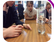
Panthers - @EstcourtYear4

We were amazing scientists this week as we learnt all about our next form of matter-gases! We completed 4 different experiments and learnt lots of different properties of gases. Then, we resilient when completing our tests with so many of us beating our scores from last term! Well done Panthers!