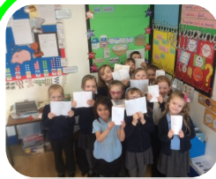
F1 - @EstcourtFS1

In Year One the Lions and the Penguins have been busy scientists as we looked at the properties of a range of different materials. Then we worked further on these materials by using DT skills to weave them together, in order to create a basket.