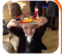
F2 - @EstcourtFS2

We have worked really hard in the Spiders and Frogs. We were creative and worked on a range of different ideas in the Lego corner. Then, in Topic we have made some fantastic pieces of Art and Writing for our learning gallery!