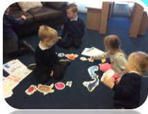
F1 - @EstcourtFS1

This week we have been learning all about whales. Did you know that a blue whale weighs as much as 30 elephants and that its heart is the size of a small car? Make sure you ask us for more facts about whales!