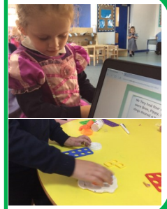
F2 - @EPAF2

The Frogs and Butterflies have been extremely busy this week, working hard on their baseline activities on the computer. The children have also been developing their skills in Maths and Writing. They have been using Numicon to add one more and learning to write super sentences with a capital letter and a full stop. Well done to all!